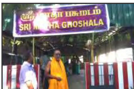
Shri Matha Goshala