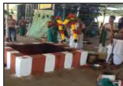
Presenting soulful offerings for poornahuthi at Guru Peyarchi Yagna in Madambakkam