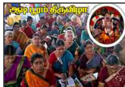
Aadi puram in chennai