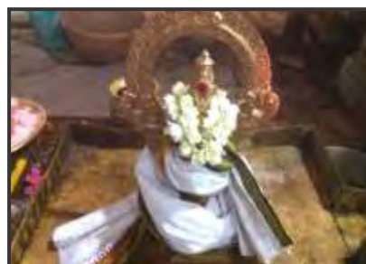
Sri Chitraguptar's Idol at out Madambakkam temple