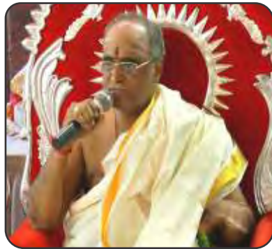
Gopala sundari, the ultimate power!

If we are to talk about the bhakti or devotion of love, the relationship between Radha and Krishna can be quoted. I actually enquired with a Krishna devotee: 'When there are Rukmini and Satyabama as his consorts, where did this Radha come from?' he was bewildered for a moment but then he instantly regained his wits and said that it would be the bond of bhakti between the lord and his devotee, and can be termed as the bhakti of love. These days everyone seems to celebrate Radha Kalyanam with a lot of pomp; but Rukmini or Satyabama wedding is very rarely conducted. A permanent relationship must be carried on in a veil of secrecy is what is reflected through this