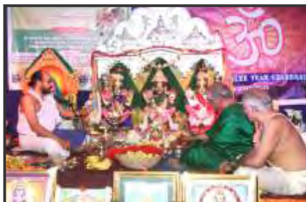
Guruj performing Lalitha Trishathi Kumkumaarchana at Mulund Bhajana Samaj on Aadipooram day