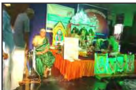
Guruj at Mulund Aadi Pooram Celebrations