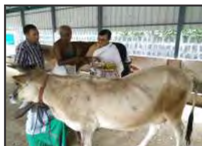
go pooja in madambakkam in the renovated goshala